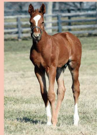
Corinthian-Pearly Beach Colt