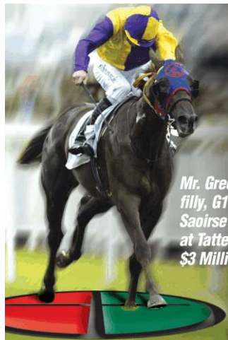
Mr. Greeley's filly, G1 Winner Saoirse Abu sold at Tattersalls for $3 Million

International Sire Mr. Greeley $75,000 LFSN