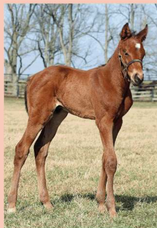
Corinthian-Texas Rush Colt