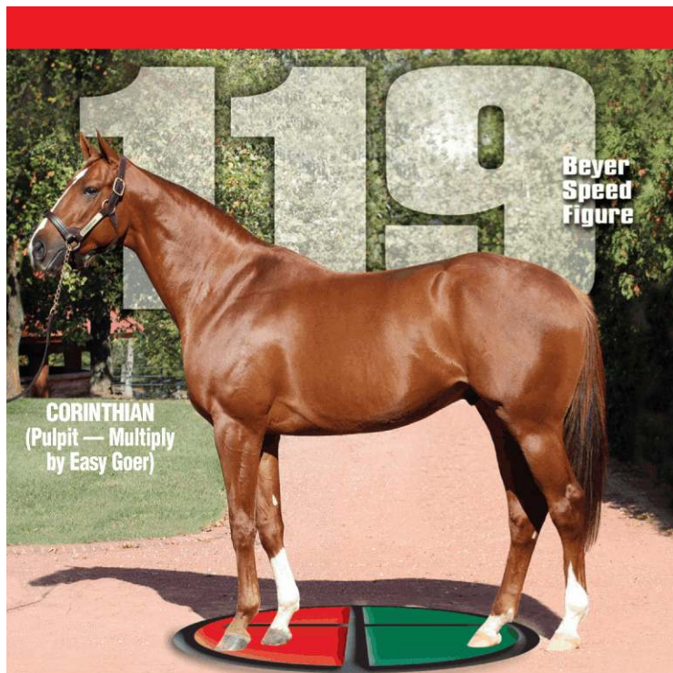
CORINTHIAN (Pulpit — Multiply by Easy Goer)