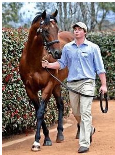
Exceed and Excel

Exceed and Excel already has four stakes-winning juveniles from his second Australian crop, which, like its predecessor, was sired at a fee of A$55,000. After four years at this figure, Exceed and Excel had his fee doubled in 2008, following his first-season sires' championship.