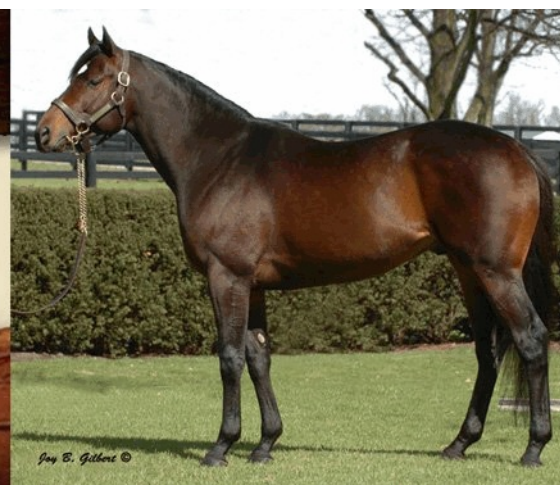
Jay B. Gilmore ©