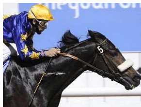
Gloria de Campeao

GLORIA DE CAMPEAO (BRZ) (h, 6, Impression {Arg}--Audacity {Brz}, by Clackson {Brz}), eighth in the 2008 G1 Dubai World Cup, was taken to France following the 2008 Nad Al Sheba racing season.