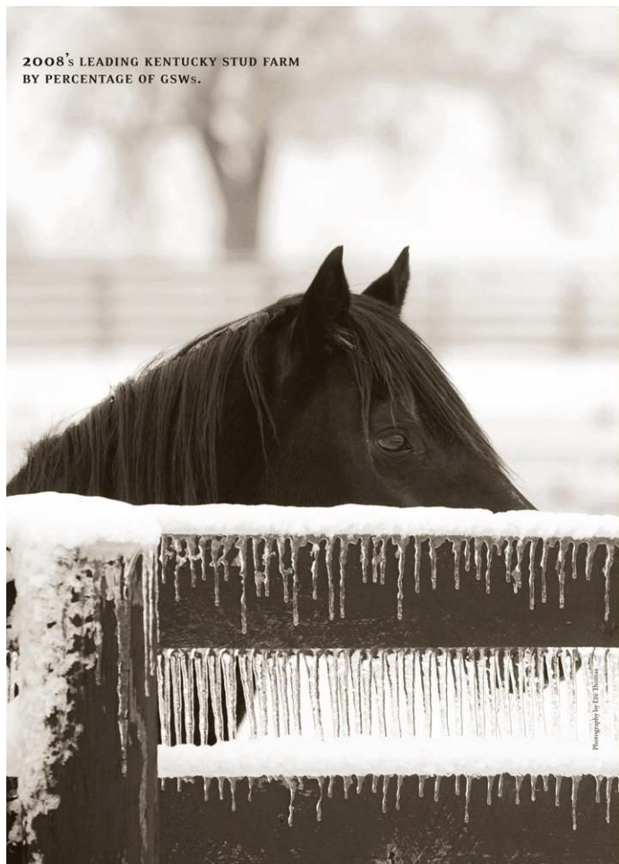
2008's LEADING KENTUCKY STUD FARM BY PERCENTAGE OF GSWs.