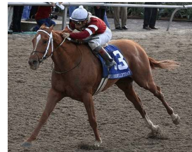
War Echo