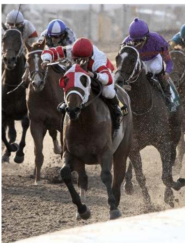
Friesan Fire wins Risen Star

Friesan Fire (A.P. Indy) remains on track in his attempt to become the first horse to sweep the Louisiana