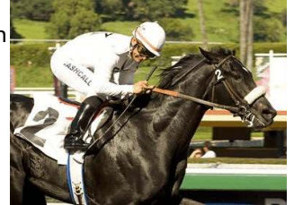
Mr. Hot Stuff