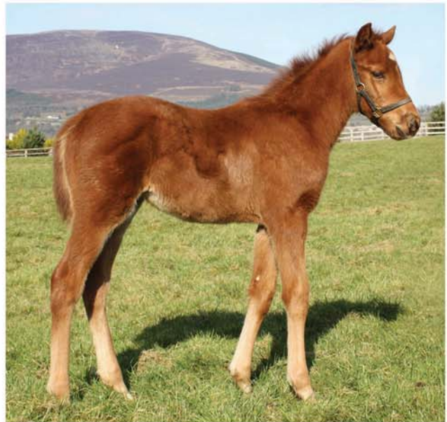
Filly born 21st January ex. Subito (Darshaan) , owned by Lynch Bages Ltd. & Samac Ltd.

“Ultimately rated more highly than his sire... Excellent Art is well qualified to get high-class middle-distance performers, but he is sure to get his quota of sharp youngsters as well.”