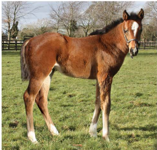
Filly born 21st January ex. Riotous Applause (Royal Applause) , a half-sister to Racing Post Trophy-Gr.1 winner & Epsom Derby-Gr.1 favourite Crowded House , owned by Car Colston Stud.