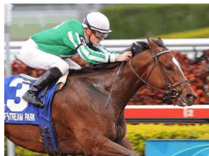
Capt. Candyman Can

After winning the GIII Iroquois S. over Churchill's one-turn mile Nov. 1, Capt. Candyman Can (Candy Ride {Arg}) missed by a half-length to Beethoven (Sky Mesa) in the GII Kentucky Jockey Club S. at a mile and a