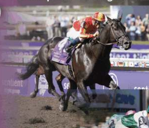
Champion Midnight Lute video