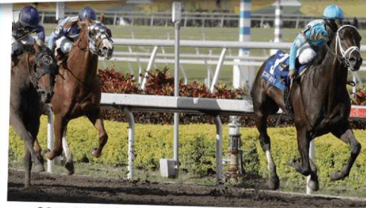
SCAT DADDY : winner of the Champagne S.-Gr.1 at 2 & the Florida Derby-Gr.1 (PICTURED) at 3.