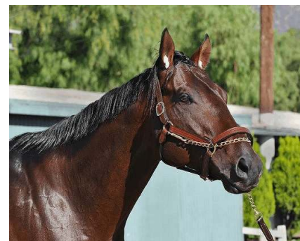
Tiago