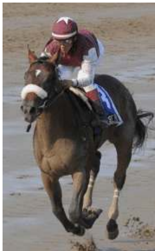
Desert Party

The Fasig-Tipton Calder Two-Year-Olds in Training Sale has never been short on quality and its long list of alums stands testament to that fact. As recently as last year, the sale turned out some eye-catching prospects,