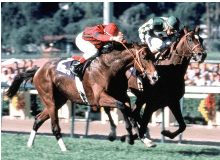
1986 Turf: Manila (1983-2009) defeats Theatrical

DIRC SESSION OF HIT SALE KICKS OFF The Dubai International Racing Carnival Session of the Emirates Racing Authority Horses in Training Sale, held in association with Tattersalls, commences at 5 p.m. today. Multiple group winners Biarritz (SAf) (Count Dubois {GB}), Royal Vintage (SAf) (Rich Man's Gold) and Vertigineux (Fr) (Nombre Premier {GB}) will be offered as lots 8 , 34 and 35 , respectively. Fellow MGSW Lord Admiral (El Prado {Ire}) has been withdrawn. Vertigineux chased home G1SW Archipenko (Kingmambo) to finish second in last Thursday's G3 Zabeel Mile at Nad Al Sheba. Biarritz, the highest-rated horse in the sale at 112, reported home seventh in that race. The ERA Horses in Training session will begin Wednesday at 3:00 p.m. A catalogue and list of withdrawn horses is available at emiratesracing.com/era/hit-sale.html .