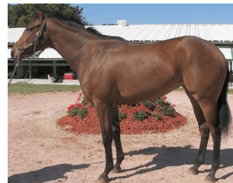
Hip 146 - Speightstown filly