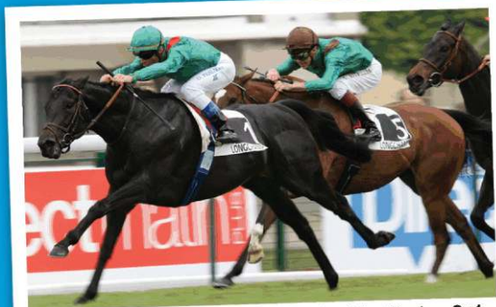
H.H. Aga Khan's SAGEBURG wins the Prix d'Isphan-Gr.1. He was one of 6 individual GSW's by Johannesburg in 2008.

Now sire of 15 GSW's from his first 3 crops: Diamond Tycoon made it three straight wins in the Fair Grounds Handicap-Gr.3 on 02/07/09.