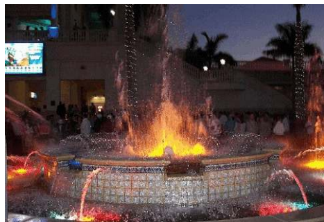
Fasig-Tipton party at Gulfstream

Actively courted by Fasig-Tipton have been players from the international arena, including connections from Europe and Japan, which, according to Boyd Browning, have become an important focal point in the evolving program. "From the European perspective, we had a lot of success from a limited number of horses that have been sold here and were successful overseas," explained Browning. "We are developing a bit of a following, and we're trying to expand that as quickly as possible." No strangers to the juvenile sales arena, the Japanese have remained faithful, despite having scaled back somewhat on spending over the past few years. However, Japanese interests appeared to be back in force this year, with a number of buying groups seen examining horses in the