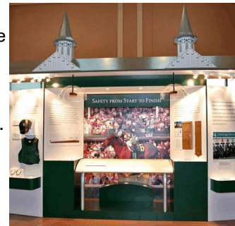
Churchill Downs Safety Center

Churchill Downs Incorporated has announced a series of new rules and policies to improve the safety and welfare of horses and riders. These initiatives will be in place at Churchill Downs for the opening day of its Spring Meet Apr. 25, and will be phased in at other CDI tracks--Arlington, Calder and Fair Grounds--by 2010. Featured in the new measures are: