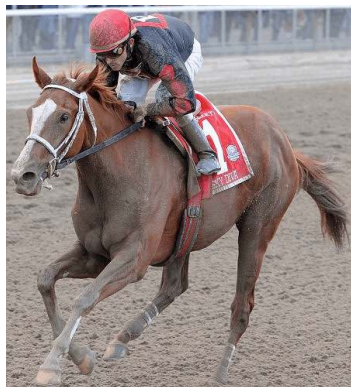
Sky Diva