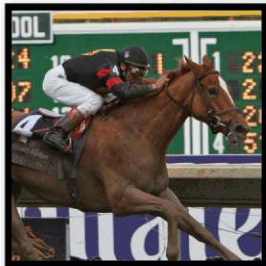
GINGER PUNCH 2005 Sales Grad 2007 Eclipse Champion