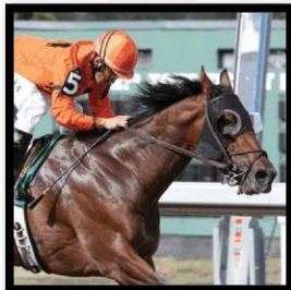
FATAL BULLET 2007 Sales Grad 2008 HOY Canada