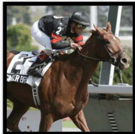
GINGER BREW 2007 Sales Grad 2008 3yo Champ