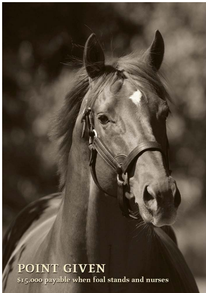
POINT GIVEN $15,000 payable when foal stands and nurses