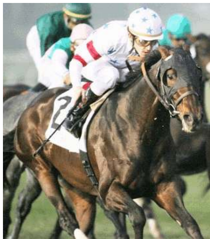
Court Vision

The last time IEAH Stables and WinStar Farm's Court Vision (Gulch) made the trans-continental flight to Southern California, the fashionably bred colt stormed from last to defeat a field including Cowboy Cal (Giant's Causeway) in the GI Hollywood Derby over the cross-town turf course. A dual graded-stakes winning two-year-old, Court Vision could not quite measure up with the best of his generation on the Triple Crown trail