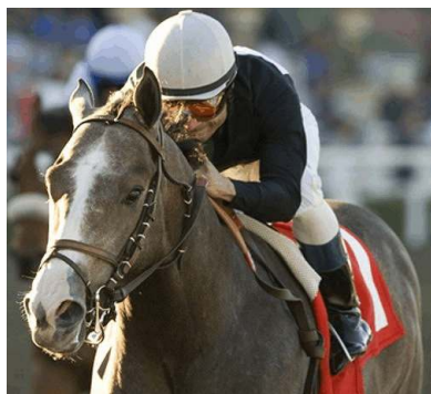
The Pamplemousse Benoit