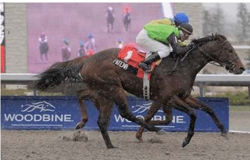
Patena (outside) at Woodbine