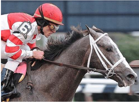
Old Fashioned

Fox Hill Farms's unbeaten Old Fashioned (Unbridled's Song) has been assigned post one in Saturday's GII Rebel S. at Oaklawn Park. The "TDN Rising Star" closed out his juvenile campaign with a dominating win in the GII Remsen S. at the Big A Nov. 29. He picked up right where he left off in his sophomore debut, stalking Silver City (Unbridled's Song) in the GIII Southwest S. Feb. 16, before powering clear to a