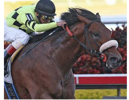
Quality Road