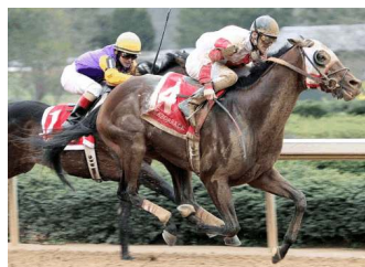
Let It Rock