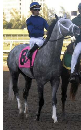
Dunkirk