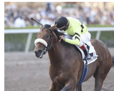
Quality Road