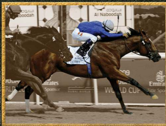
LGB, LLC