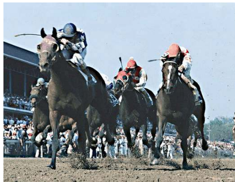
Alysheba (1984-2009) winning 1987 Kentucky Derby

ALYSHEBA DIES Former Horse of the Year Alysheba (Alydar--Bel Sheba, by Lt. Stevens), an epic winner of the GI Kentucky Derby in 1987, was euthanized Friday evening at the Hagyard Equine Medical Institute in Lexington, Kentucky, after sustaining a fall in his stall at the Kentucky Horse Park. He was 25. The bay, repatriated from Saudi Arabia in October, was transported