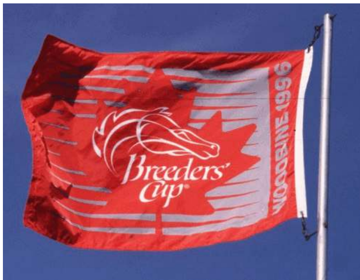
The Breeders' Cup traveled outside the U.S. for the first time in '96