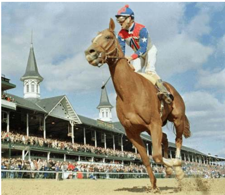
Arazi winning the '91 Breeders' Cup Juvenile

This has been a very open and inclusive process--people have been generous with their time and people have been keen to get involved. If it turns out that there are views that haven't been aired that seek to strike down conclusions in this report that haven't been aired until it has been completed then I think something has seriously gone wrong. Everybody who is part of the Breeders' Cup and feels strongly about the Breeders' Cup must not miss this opportunity to get involved in the discussion because I think questions need to be asked if those views are not aired at this point in time.