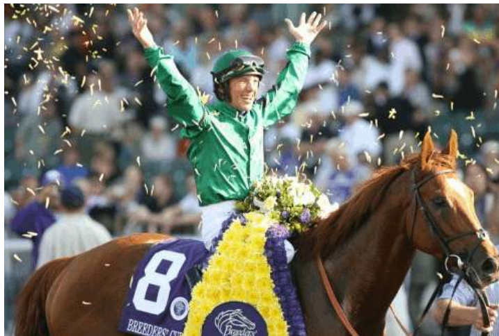
Frankie Dettori & Raven's Pass take '08 BC Classic