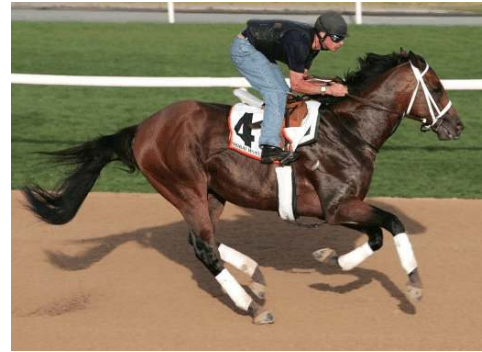
Dubai Racing Club