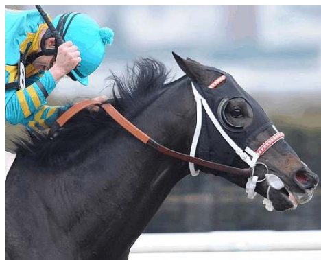
I Want Revenge