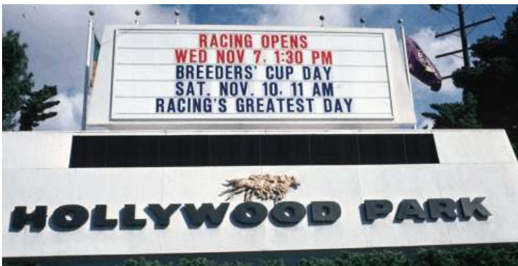
Hollywood Park before the inaugural Breeders' Cup in '84