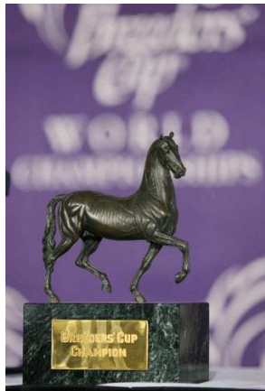
Breeders' Cup Trophy