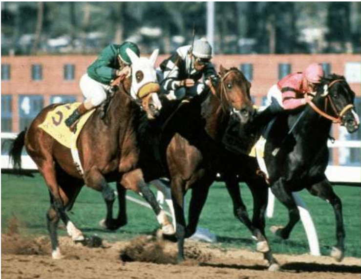
Wild Again (rail) takes inaugural Breeders' Cup Classic