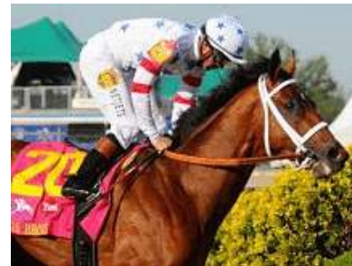
April coverboy Big Brown