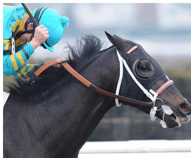
I Want Revenge