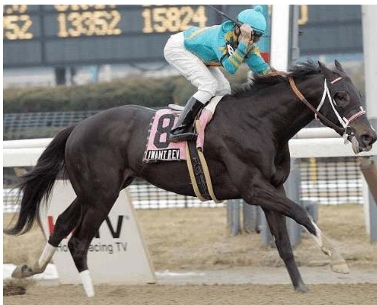
I Want Revenge and Joe Talamo streak home in the Gotham S.