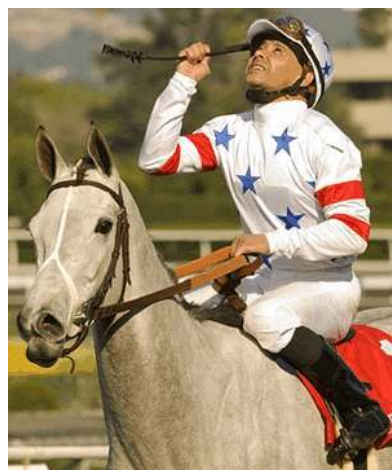
Stardom Bound