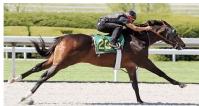
Hip 23, fastest 1/8th during Thursday's breeze show

Consignors remain guarded in the face of a two-year-old market that has been down about 30 percent from a year ago. "You always want to remain positive," said Niall Brennan. "But realistically, we probably can't expect too much of anything other than more of the same, which is just a polarized market. When you look at the industry, there are still people buying horses--