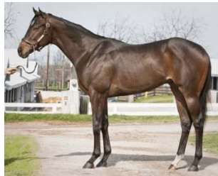
Hip 31 EquiSport

Hamm purchased a daughter of Street Cry (Ire) for $50,000 at last year’s Keeneland September Sale. Out of 22-year-old Pay Bird (Storm Bird), the filly’s three-year-old full sister Valid Sum powered home to an impressive maiden victory at Aqueduct Mar. 12 ( video ). The two-year-old, consigned to the April sale as hip 200 , went two furlongs in