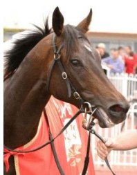
Alinghi (Aus) www.freedman.com.au