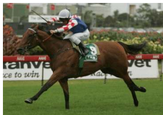
Dance Hero (Aus) www.stallions.com.au