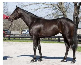
Hip 41 EquiSport

“They're both big, big two-turn horses,” Woods said.