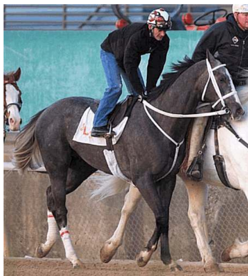
Old Fashioned at Oaklawn Monday

A month ago, Fox Hill Farm's Old Fashioned (Unbridled's Song) was unbeaten and at or near the top of