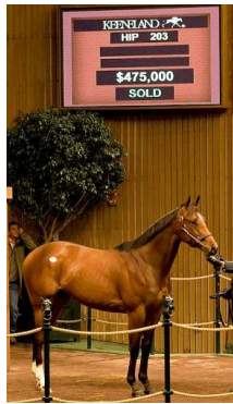
Tuesday's Topper - Hip 203 EquiSport