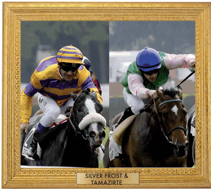
SILVER FROST & TAMAZIRTE

Artiste Royal (Ire) (Danehill), 6fT, 1:17.60 h 10/12 Black Mamba (NZ) (Black Minnaloushe), 7fT, 1:30.00, 1/3 Champs Elysees (GB) (Danehill), 5f, :59.80, 9/77 Chocolate Candy (Candy Ride {Arg}), 5f, :59.20, 3/77 Magnum (Arg) (El Compinche {Arg}), 6f, 1:11.20, 1/1 U S Ranger (Danzig), 6fT, 1:16.20, 6/12 Whatsthescript (Ire) (Royale Applause {GB}), 5fT, 1:03.20, 4/10 Zambezi Sun (GB) (Dansili {GB}), 5f, :58.80, 2/77