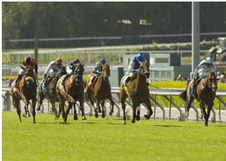
Gotta Have Her (widest) pins her ears and rallies