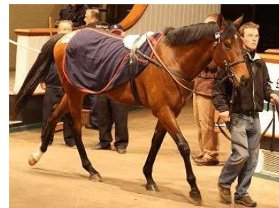
Lot 85 - Medaglia d'Oro colt