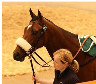
Lot 49 - Invincible Spirit filly www.tattersalls.com