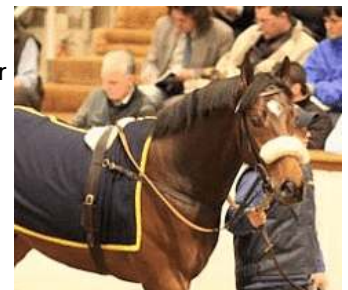
Lot 55 - Giant's Causeway colt