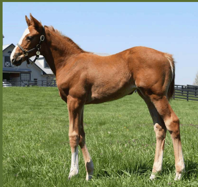
The first foal from champion Rags to Riches (A.P. Indy), a filly by Giant’s Causeway, born Mar. 9 at Ashford Stud. Rags to Riches is back in foal to first-season sire Henrythenavigator (Kingmambo).