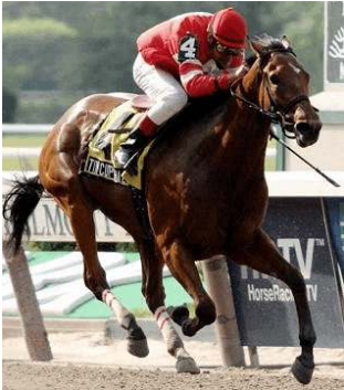
Tin Cup Chalice