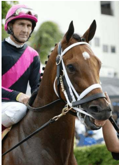
Madcap Escapade