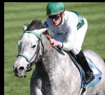
Champion FOREVER TOGETHER wins the G2 Jenny Wiley Stakes