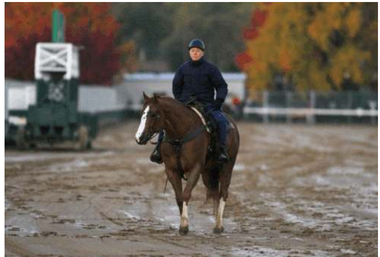
Brothers at Churchill Downs

“So far it’s been good,” he said with a chuckle. “I think I’ve done the right thing. I’ve trained some wonderful horses for some fine people. I started out walking hot, and wound up having a lot of fun.”