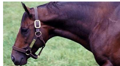
Pulpit at Claiborne claibornefarm.com