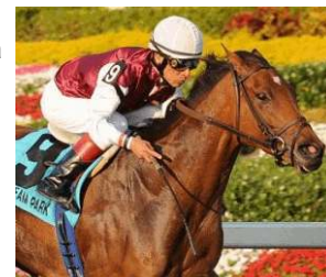
Criticism