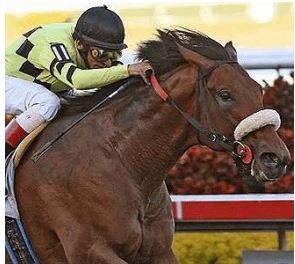
Quality Road