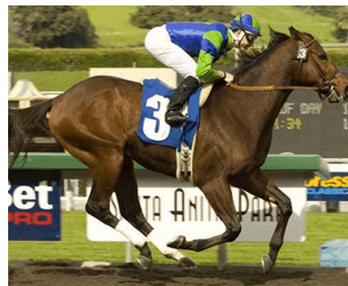
Rail Trip

From his five career starts, undefeated Rail Trip has been behind a total of two horses for about a half-mile in his second career appearance. That could change this