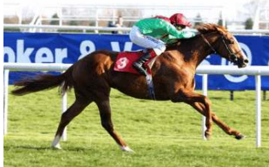
Gitano Hernando