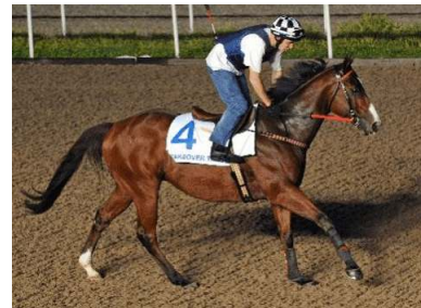
Takeover Target turfclub.com.sg

As good as ever at the age of 10, Takeover Target (Aus) (Celtic Swing {GB}) is back to defend his title in this co-featured event in which he established a new track record of 1:08.8