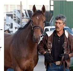
Mine That Bird