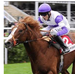
Crowded House