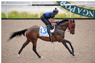
Rocket Man Singapore Turf Club

Takeover Target departed from the two hole en route to his half-length victory in the 2008 KrisFlyer, and connections could barely contain their excitement when their 10-year-old drew post position three for his title defense. "He's a jump-and-run horse who will be on top