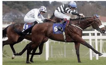
Recharge