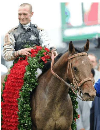
Mine That Bird