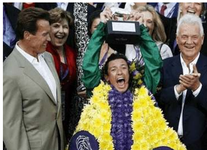
Schwarzenegger (left) at the 2008 Breeders' Cup

STATE TO SELL DEL MAR? According to published reports, California Gov. Arnold Schwarzenegger has proposed Del Mar Fairgrounds as one of the assets to be sold to help alleviate the state's budget problems. The 400-acre property has been valued at as much as