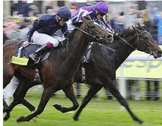
Black Bear Island (outside)

Fresh from filling the first two spots in Thursday's G3 Chester Vase, Aidan O'Brien was repeating the feat with TDN Rising Star Black Bear Island (Ire)