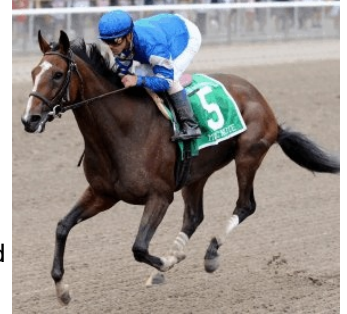
Music Note

MGISW Music Note (A.P. Indy) will make her 2009 debut in the GI Ogden Phipps H. at Belmont June 13, reports Daily Racing Form . In 2008, the Godolphin-owned filly won the GI Mother Goose S., GI CCA Oaks and GI Gazelle S. before finishing third behind Zenyatta (Street Cry {Ire}) and dual Grade I winner Cocoa Beach (Chi) (Doneraile Court) in the GI Breeders' Cup Ladies' Classic. Returned to training in April, the filly worked a half mile in :48.47 over Belmont's main track