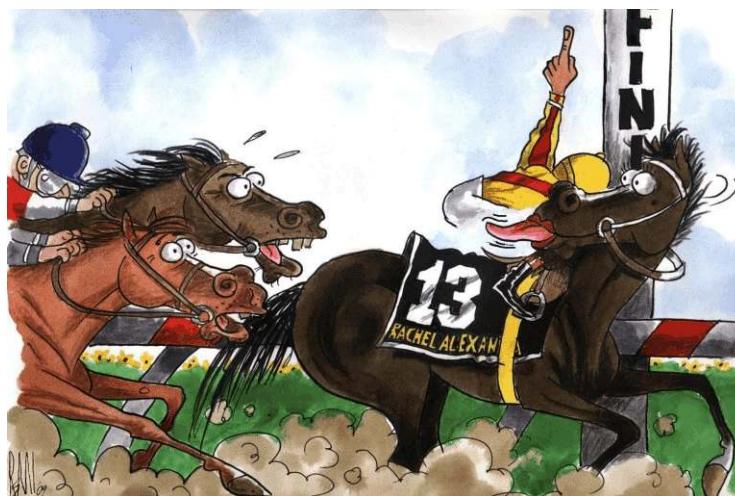
Name That Caption! The new Richland Hills Farm cartoon caption contest is now available on the farm's website, www.richlandhillsfarm.com , under the contests/features tab. The winner will receive $100 and a framed original copy of the cartoon, by Remi Bellocq, with the winning caption. Good luck!

Accomplishments: MSW. Dam of Purge (Pulpit), GISW, $905,434; Namaste's Wish (Pulpit), SW & GSP, $174,849.