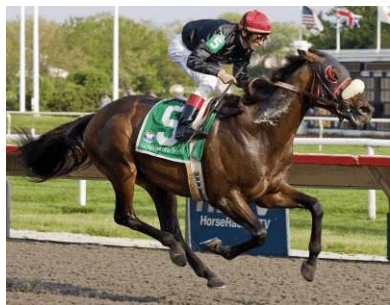
Four Footed Foto

Vacation broke through at the NW1X level in an off-the-turf allowance on Keeneland's Polytrack Apr. 3, and