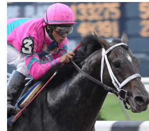
Charitable Man