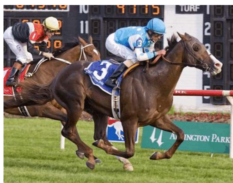
Four Footed Foto

Giant Oak captured his first two starts at Arlington on turf and Polytrack, respectively, before heading to