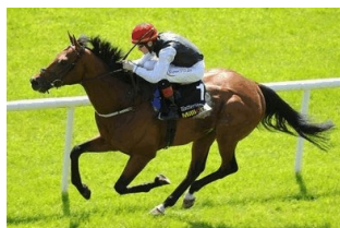
Casual Conquest (Ire)

Casual Conquest registered a six-length success in Leopardstown's G2 Derrinstown Stud Derby Trial last May to book his spot in the line-up for the G1 Epsom Derby and was far from disgraced when third on the first Saturday in June. Runner-up to Frozen Fire (Ger) (Montjeu {Ire}) in the G1 Irish Derby here later that month, the homebred was on the shelf before reappearing with a runner-up finish behind the previously listed-placed Bronze Cannon (Lemon Drop Kid) in a badly cut-up renewal of the G2 Jockey Club S. at Newmarket