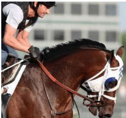
Flying Private

Trainer D. Wayne Lukas said yesterday that Luv Gov (Ten Most Wanted), eighth in the GI Preakness S., and Flying Private (Fusaichi Pegasus), fourth in the second