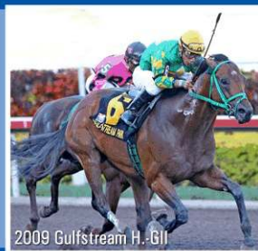
2009 Gulfstream H.-GII

WHAT IS OPPENHEIM ON ABOUT NOW? Whether it's sales, racing or breeding...read the latest musings from Bill Oppenheim! You can find all of Oppenheim's columns in the TDN Archive .