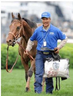
Mine That Bird after the Kentucky Derby

Calvin Borel is in line to become the first rider to sweep all three races of the Triple Crown with different mounts. Following the announcement that Rachel Alexandra (Medaglia d'Oro) would not contest the GI Belmont S., it was revealed that Borel would be reunited with Kentucky Derby hero Mine That Bird (Birdstone) in the "Test of Champions." Mike Smith had piloted the gelding to his second-place finish in the GI Preakness S., but had a prior commitment in California for June 6. "Now that this decision is made, I am excited to come to New York and ride Mine That Bird in the Belmont Stakes,"