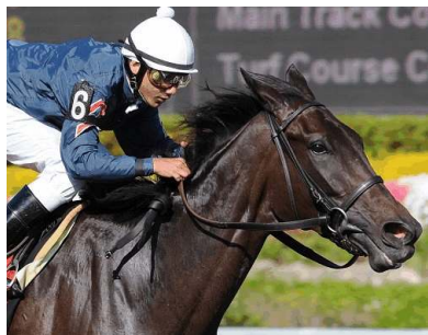
Gozzip Girl