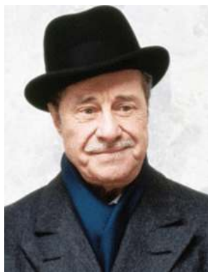
Don Ameche, the actor

Fans of the movies remember Don Ameche as the enduring Hollywood actor who appeared in such films as The Three Musketeers (1939) and Girl Trouble (1942) and, later, Trading Places (1983) and Cocoon (1985).