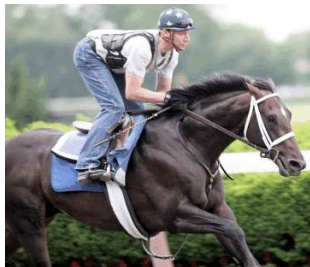
Charitable Man