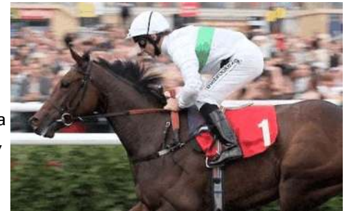
Rainbow View

Guineas and see out the extra half-mile. "I'm very clear in my mind that she will stay a mile and a quarter, but I don't know about a mile and a half--you can only find out when you race them," trainer