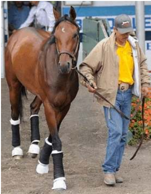
Mine That Bird arrives for the Belmont

Double Eagle Ranch and Buena Suerte Equine's Mine That Bird (Birdstone) drew post position seven and was made the 2-1 morning-line favorite as he seeks to become the first winner of the GI Kentucky Derby to double up in the GI Belmont S. since Thunder Gulch