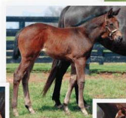
▼ Bates Choice bay filly 3/17/09