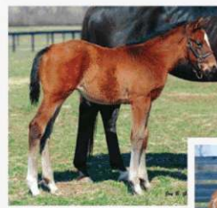
Confederate Lady ▲ bay colt 2/16/09