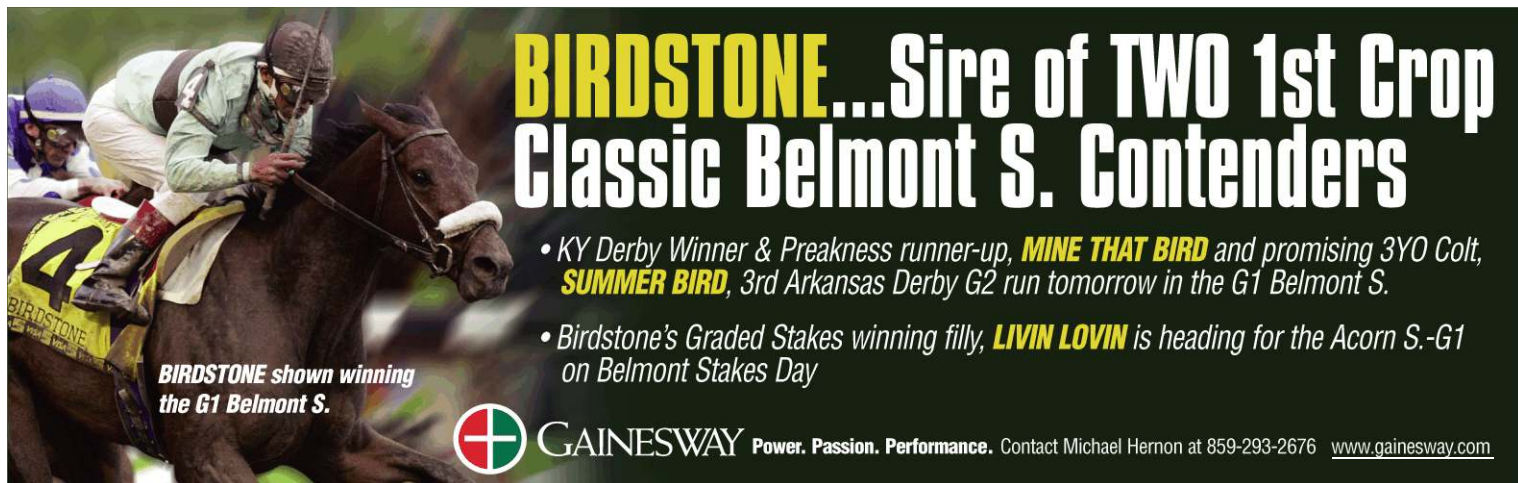
BIRDSTONE shown winning the G1 Belmont S.