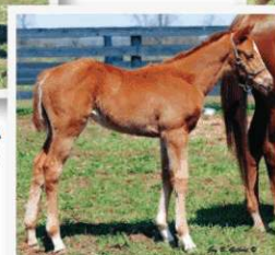
◀ Reeyre ch. filly 2/10/09