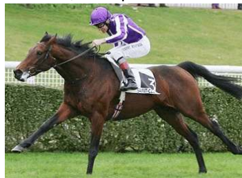
Fame and Glory

In the week that the racing world lost Vincent O'Brien, an apt winner of the race so associated with and beloved of the great man would be Fame and Glory .