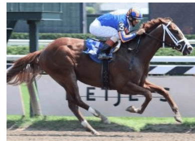
Munnings