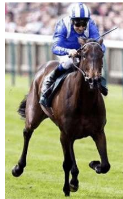
Ghanaati