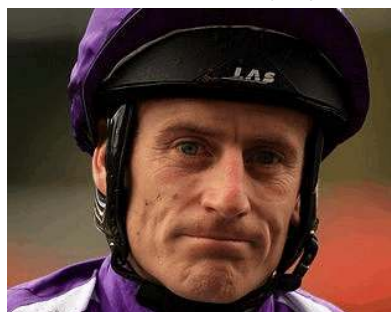
Johnny Murtagh

Jockey Johnny Murtagh has failed in his bid to overturn the five-day ban received for his ride aboard Frozen Fire (Ger) (Montjeu {Ire}) in last week's G1 Coronation