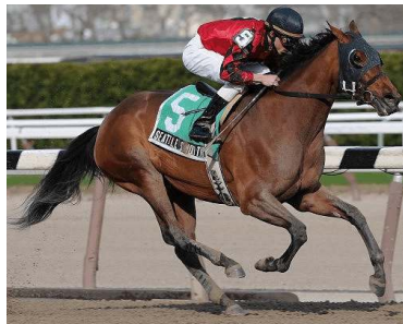
Seattle Smooth Adam Coglianesse

With the GI Breeders’ Cup Ladies’ Classic scheduled to be contested over Santa Anita’s ProRide surface, Mercedes Stables decided to shut down Seattle Smooth for the rest of 2008.