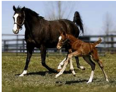
Happy Ticket and her 2008 colt by Distorted Humor www.glencrestfarm.com