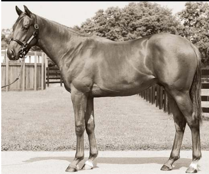
2008 DROUGHT BREAKER, BY FLOWER ALLEY $20,000 payable when foal stands and nurses