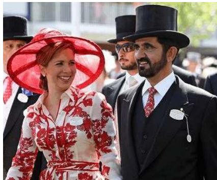
Sheikh Mohammed & Princess Haya

If there is strength in numbers, Sheikh Mohammed will be tough to beat in today's GI Ogden Phipps H. at Belmont Park. The Sheikh's overarching operation will send out three of the seven runners in the 1 1/16-mile feature: Music Note (A.P. Indy) and Seventh Street (Street Cry {Ire}) will carry the Godolphin blue, while Stonerside acquisition Sea Chanter (War Chant) will sport the Darley maroon and white. The Godolphin duo have been installed as the