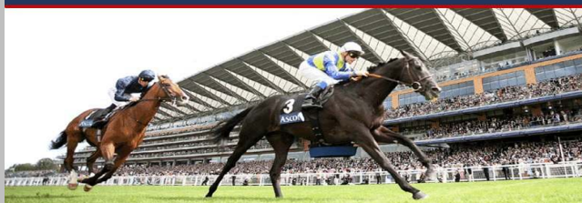
15.15 SNP Bikini Babe (Ire) (Montjeu {Ire}) leads nearly every step in her second appearance. 19.35 CHP Alpen Glen (GB) (Halling) romps in her career debut.