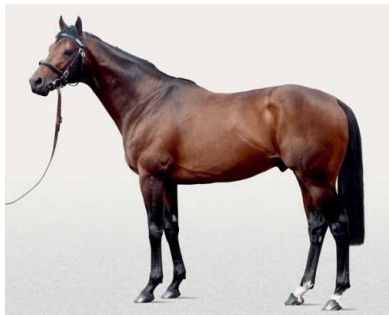
...and Shirocco, both at Darley darleystallions.com

With the German Derby and Oaks (Preis der Diana) still to be contested, there are probably further Classic contenders in the pipeline for the Gestut Schlenderhan star.