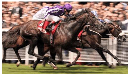
Mastercraftsman (outside)