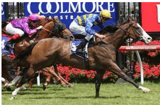
Scenic Blast stallions.com.au

turned up the pressure in recent times, and the latest dragster from Down Under is Scenic Blast (Aus) (Scenic {Ire}), who has emerged from the white heat of that country's