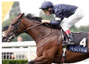
Henrythenavigator (Kingmambo) defeats Raven's Pass (Elusive Quality) in last year's G1 St. James's Palace S. at Royal Ascot Click here to watch the video