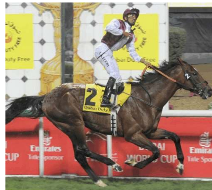
Gladiatorus in Dubai