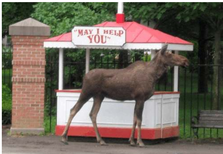
Saratoga employees arrived Monday to find a cow moose wandering on the sidewalk outside the track. The moose was tranquilized and returned to its natural environment

So, what can you do? Go to www.horseswork.com , the excellent KEEP website. It is full of information, from presenting the facts to providing contact numbers for elected officials. There is an easy way to find your representative or senator. Call them at the state capitol at (502) 564-8100, or e-mail them and voice your support of VLTs at the tracks. Be sure to mention if you are a constituent, or if you board your horses in their district. Believe me, our opposition is doing this and generating a large volume of calls through their church e-mail calls to action. Comments for publication? Please email TDN management at suefinley@thoroughbreddailynews.com