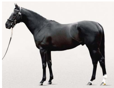
Monsun's sons Manduro...

Monsun may be best known in North America as the sire of the graded winners Royal Highness, Noble Stella and Lauro, but in Europe he has made his name by producing a Classic winner in most of his first 10 crops, even though these crops average fewer than 60 foals.