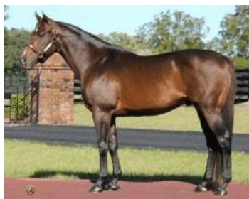
Proud Accolade (2002-2007)

PROUD ACCOLADE EUTHANIZED Bridlewood Farm announced that freshman sire Proud Accolade (Yes It's True--Proud Ciel, by Septieme Ciel) was euthanized Tuesday due to "a severe neurological condition."