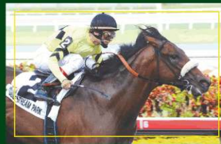
G1W QUALITY ROAD