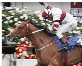
COLLECTION Hong Kong Derby, Gr.1