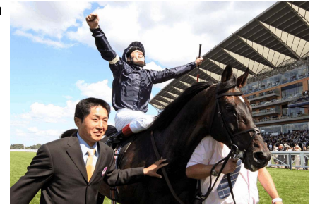
After last year's Gold Cup