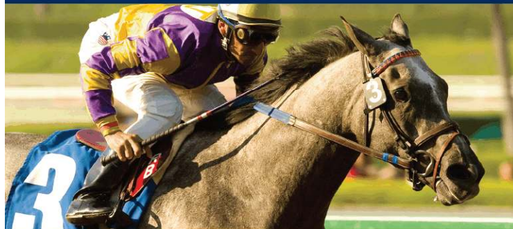
Tattersalls July Sale purchase MONZANTE, winner of the 2008 Grade 1 Eddie Read Handicap at Del Mar