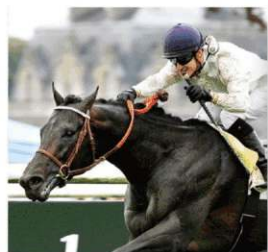
LE HAVRE Prix du Jockey-Club, Gr.1