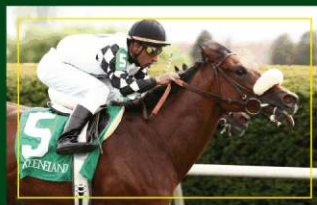
G1W DIAMONDRELLA (GB)