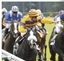
SILVER FROST Poule d'Essai des Poulains, Gr.1