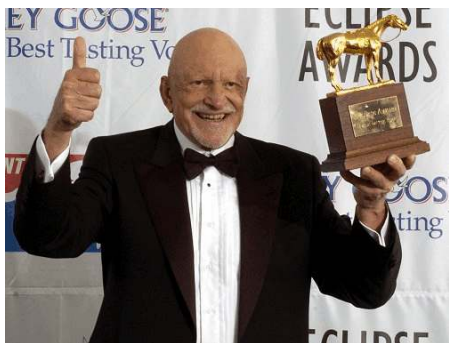
Jess Jackson

While Jackson nixed a run in the 2009 Breeders' Cup, he left open the possibility of keeping Rachel in training as a four-year-old and pointing her to the 2010 Breeders' Cup, to be held at Churchill Downs. In the more