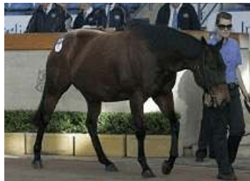
Polar Success inglis.com.au

G1 Golden Slipper heroine Polar Success (Aus) (Success Express--Patou {Aus}, by Covetous {Aus}) elicited a bid of A$1.2 million to highlight Thursday's opening