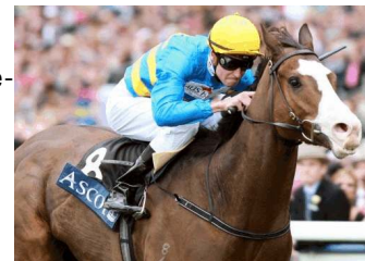
Scenic Blast