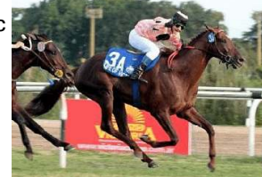
Life of Victory

Argentine Horse of the Year and reigning G1 Carlos Pellegrini hero Life of Victory will hope the third time's the charm in this valuable affair. Sixth in the 2007 Estrellas Classic conducted over this course and distance, the chestnut was a distant second in the 2008 renewal over the Palermo dirt. He kicked off his autumn campaign with a fourth in the G1 Grande Premio Asociacion Latinoamericana Jockey Club at Brazil's Cidade Jardim Mar. 13, and most recently missed by a head when second in the G1 Gran Premio 25 de Mayo over this course May 23. Mestre, who finished third in the GP 25 de Mayo following a win in the G1 Gran Premio Republica Argentina May 1, is part of a tough entry along with Dando Amor . That filly captured the G2 Gran Premio Abril Apr. 18 going nine panels over the San Isidro sod last out.