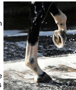
Zenyatta - a closer look