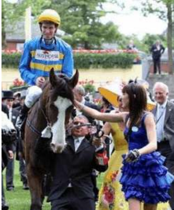
Scenic Blast