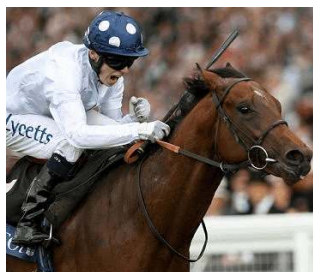
Art Connoisseur

Having conquered an all-star international cast in the June 20 G1 Golden Jubilee S. at Royal Ascot, Art Connoisseur bids to emulate Les Arcs (Arch), who pulled