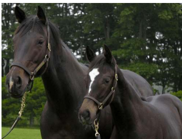
Allthewaybaby & Hip 411, by Deep Impact