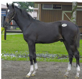
Hip 409, by Neo Universe