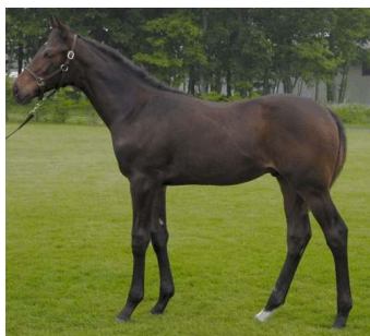
Hip 427, by Symboli Kris S

When the gavel fell for the last time Wednesday, 89 of 146 foals offered had been sold for a total of ¥1,839,500,000 ($19,363,157), which was down 35.8 percent from last year's comparable session. Average price was ¥20,668,539 ($217,563), which would be considered remarkable in any other part of the world, but was down 29.3 percent from the 2008 level.