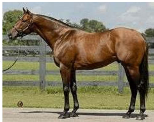
Top Freshman Sire Wildcat Heir Has Three On Offer At FTKJUL www.journeymanstud.com