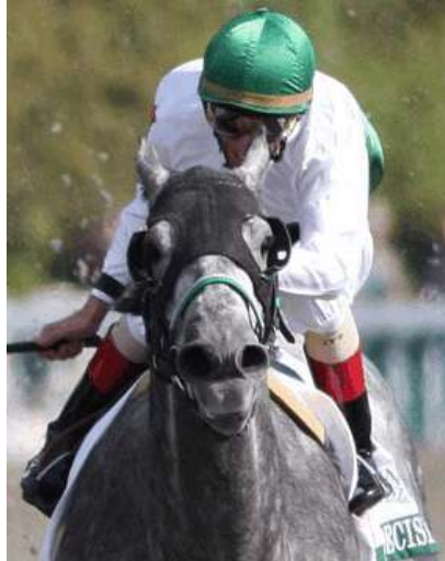
FTK July Grad Informed Decision

In the days leading up to the yearling sales' season, the weather in Lexington has been uncharacteristically springlike, with temperatures hovering in the low to