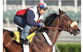
Papa Clem