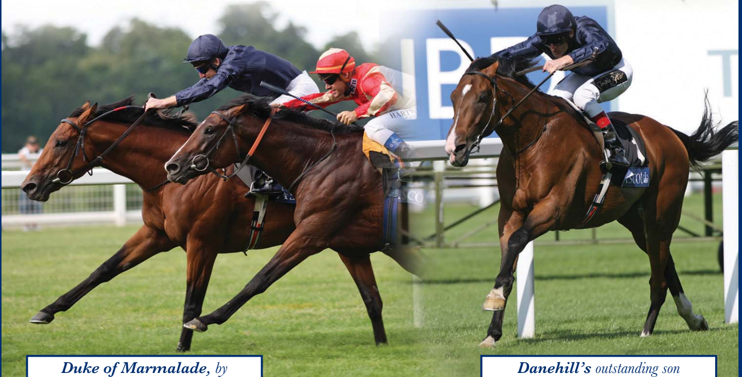
Duke of Marmalade, by Danehill, shows he is full of courage as well as class to succeed last year.