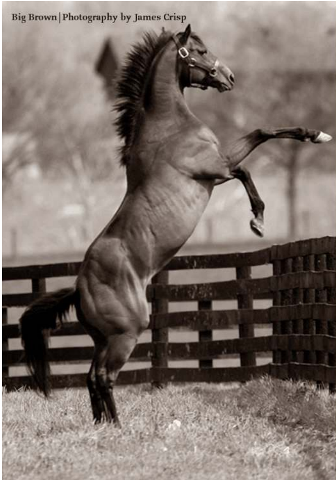
Big Brown