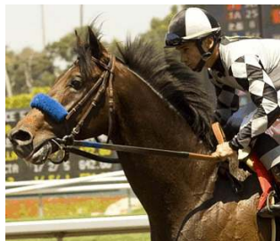
Whatsthescript

Whatsthescript , beaten a half-length when second in this race last year, looks to go one better here. The winner of the GII American H. and GII Del Mar Mile H.