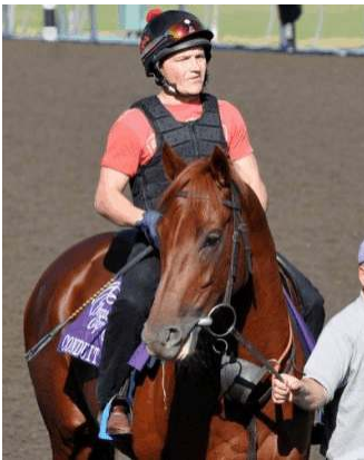
Conduit

Despite obvious form credentials, the fact that Ryan Moore chose to ride G1 Breeders' Cup Turf hero Conduit (Ire) (Dalakhani {Ire}) from a strong trio of Sir Michael Stoute runners in today's G1 King George VI and Queen Elizabeth S. may be the main pointer to his chances in the Ascot clash. Freemason Lodge's retained jockey opted out of the chance to partner Ballymacoll Stud's homebred to success in Doncaster's G1 St Leger in September, but was back on board for the tour de force at Santa Anita the following month. The four-year-old, who has done little wrong this term when a nose second to Cima di Triomphe (Ire) (Galileo {Ire}) under a heavy penalty in the May 28 G3 Brigadier Gerard S. and third in the July 4 G1 Coral-