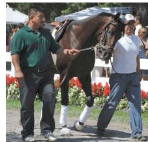
Pyro