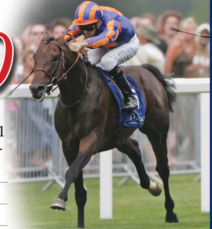
Hurricane Run, like his sire Montjeu, adds the 'King George' to his many Gr.1 victories.