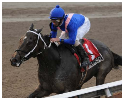
Hot Dixie Chick