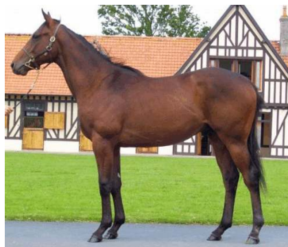
Lot 4, Smart Strike-Rose Melody

Smart Strike has developed into one of America's premier sires, and given the versatility of his progeny, his international appeal is growing. He has two catalogued at Arqana, both selling early on Day 1. The first through the ring his lot 4 , followed closely by lot 15 .