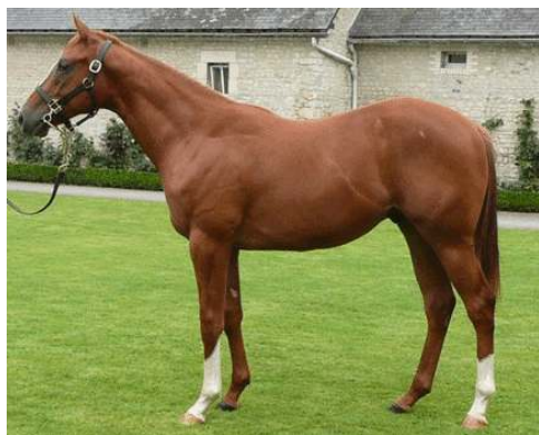
Hip 61, Storm Cat-Elbaaha Haras d'Etreham

In the current softened market, an extra premium will likely be placed on tried-and-true sires at the Arqana Yearling Sale.