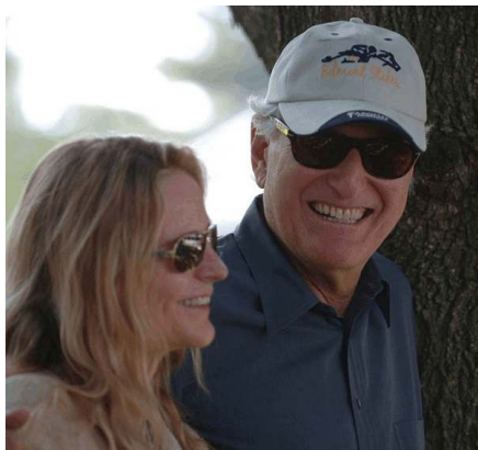
Jerry & Ann Moss

It didn't take Moss long before he started winning at the highest level. He was represented by his first black-type stakes winner with Lovely Robbery in the 1981 Santa Ysabel S., and won his first graded stakes race with Fighting Fit in the 1983 GII Mervyn LeRoy H.