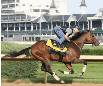
Mine That Bird