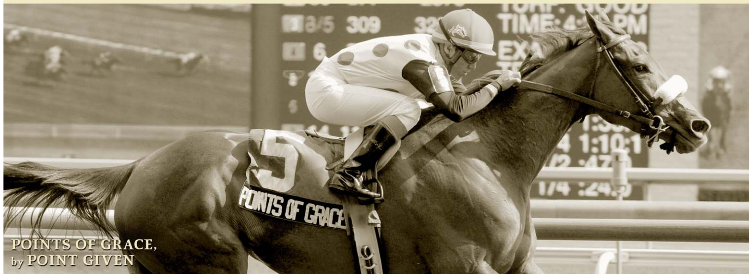
POINTS OF GRACE, by POINT GIVEN