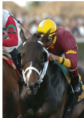
Big Drama