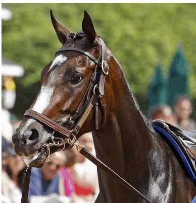
Rachel Alexandra schooling in the Monmouth paddock

Morning-line G1 Haskell Invitational favorite Rachel Alexandra (Medaglia d'Oro) arrived at Monmouth Park Friday morning, and later schooled in the paddock before a good crowd prior to the day's sixth race.