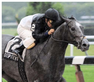
Despite the Odds

★ "TDN Rising Star" ★ Despite the Odds , winner of the off-the-turf GIII Hill Prince S. June 5, chased