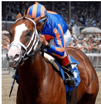
Munnings

★ "TDN Rising Star" ★ Munnings (Speightstown) looms the biggest threat to the seven-race winning