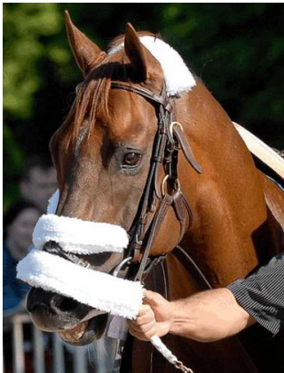
'Tator looks for 3 S Andrew

Three-year-olds and three-peats is what racing will be all about this Saturday. On the West Coast, Zayat Stables' sophomore speedster Zensational (Unbridled's