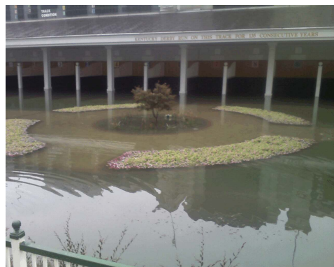
Paddock at Churchill

CHURCHILL BEGINS REPAIRS Personnel at Churchill Downs began to clean up Wednesday, one day after a slow-moving storm packing torrential rains