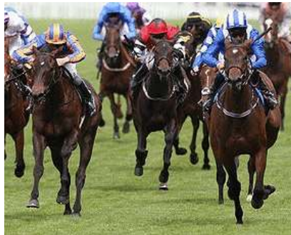
Lillie Langtry (left)

Her namesake was famous for turning heads, and Lillie Langtry (Ire) (Danehill Dancer {Ire}) had plentiful admirers at Leopardstown yesterday evening as she recorded a smooth success in the G2 Debutante S. The juvenile arrived off a 48-day break, having finished runner-up in Royal Ascot's G3 Albany S. last time out. Backed as if defeat was out of the question, the 2-5 chalk was not hard pressed to calm the nerves of those who took the plunge.