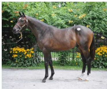
Hip 173